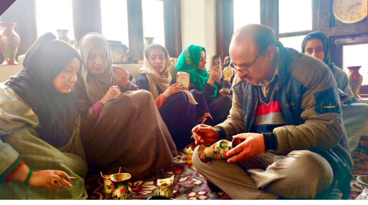
As the winter sets in the valley the artisans spend more time in their warm workshops. A busy day at the Paiper Mache Naqash workshop.